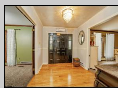
5 Edward Terrace Upper Township, NJ 08230