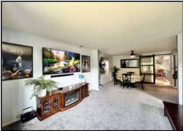
243 Churchill Egg Harbor Township, NJ 08234