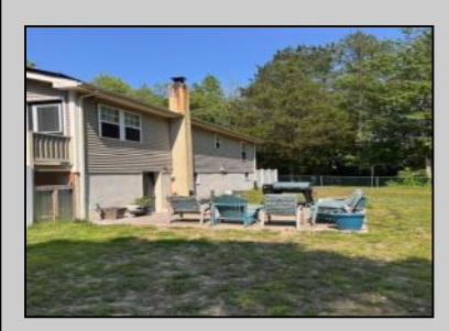
120 Head of River Corbin City, NJ 08270