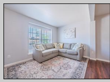
50 Jamestown Mays Landing, NJ 08330