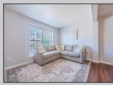
50 Jamestown Mays Landing, NJ 08330