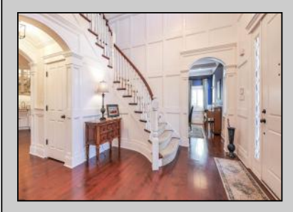
8904 Ventnor Margate, NJ 08402