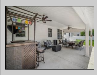
105 Chase Rd Egg Harbor Township, NJ 08234