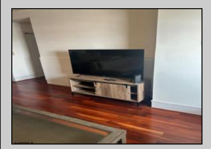
2721 Boardwalk Atlantic City, NJ 08401