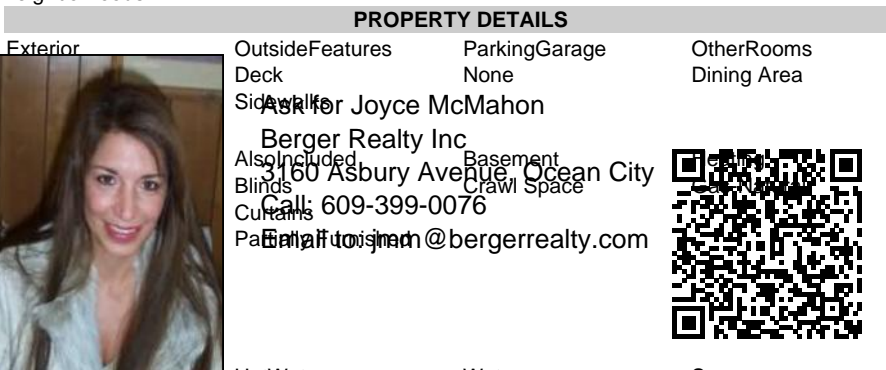
Ceiling Fan(s) Central