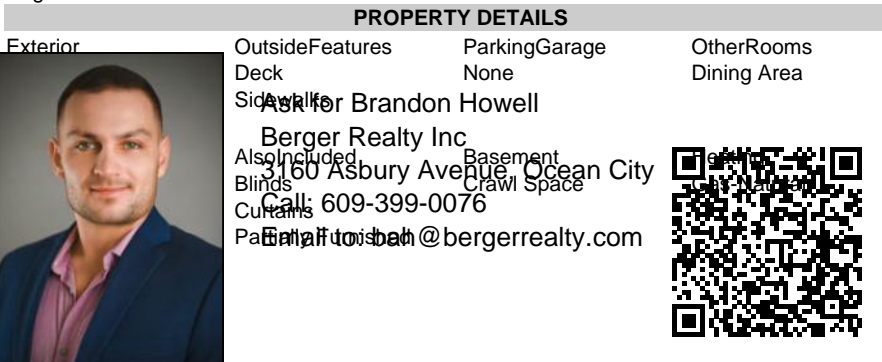
Ceiling Fan(s) Central