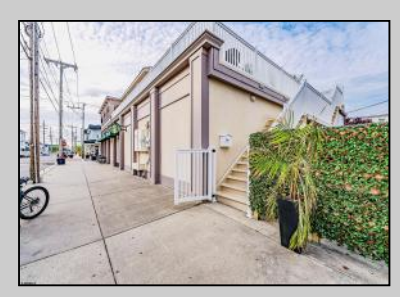
1061 Asbury Ocean City, NJ 08226