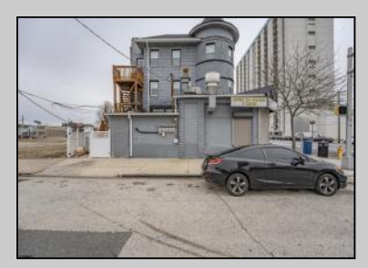
325 Atlantic Atlantic City, NJ 08401