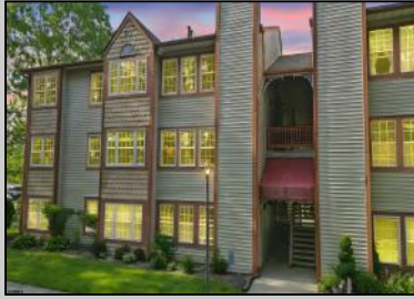
46 Trotters Galloway Township, NJ 08205