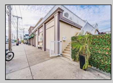
1061 Asbury Ocean City, NJ 08226