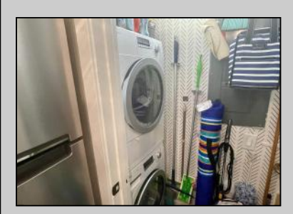
3851 Boardwalk Atlantic City, NJ 08401