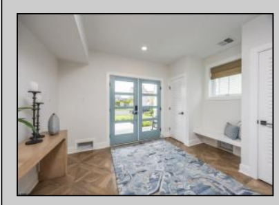
3708 Westminster Ocean City, NJ 08226