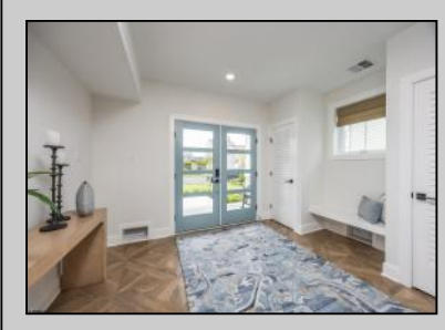
3708 Westminster Ocean City, NJ 08226