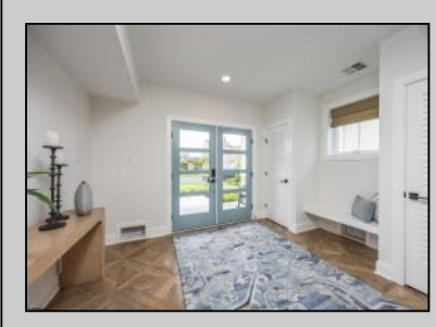
3708 Westminster Ocean City, NJ 08226