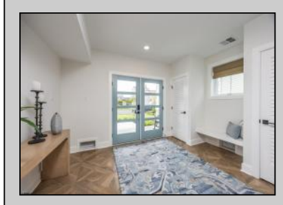
3708 Westminster Ocean City, NJ 08226