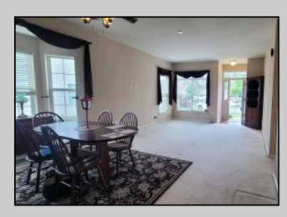
123 Bluebell Egg Harbor Township, NJ 08232