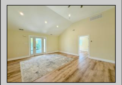
240 Dennisville Petersburg Petersburg, NJ 08270