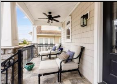
28 Huntington Margate, NJ 08402