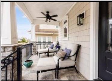
28 Huntington Margate, NJ 08402