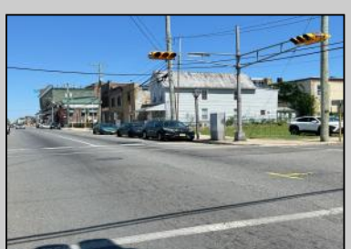
135-137 Georgia Atlantic City, NJ 08401