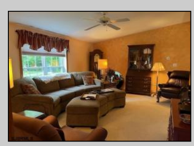
154 Muirfield Ct. Mays Landing, NJ 08330