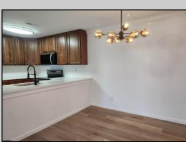
159 Heather Croft Egg Harbor Township, NJ 08234