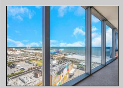
1515 Boardwalk Atlantic City, NJ 08401