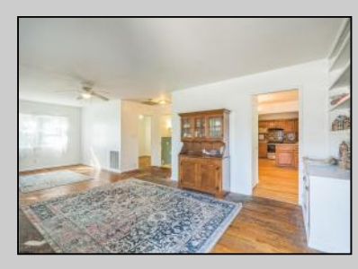
14 Roberts Marmora, NJ 08223