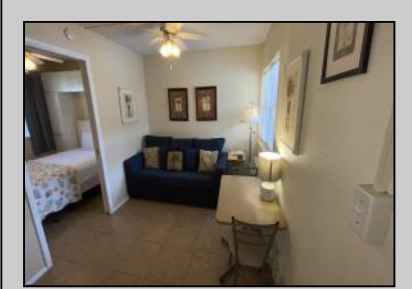
840 Ocean Ocean City, NJ 08226