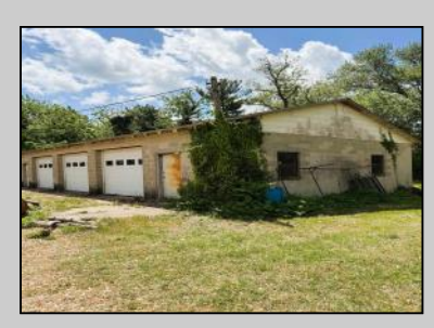
428 Richards Deerfield Township, NJ 08302