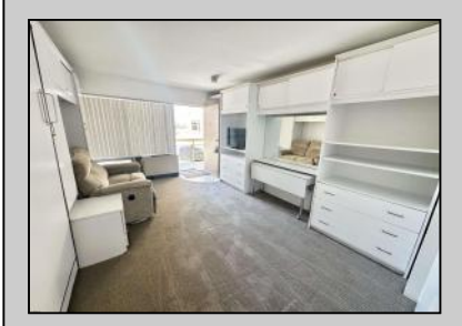
108 Montpelier Ave Apt 210 Atlantic City, NJ 08401