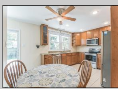
18 Pacific Ave Marmora, NJ 08223