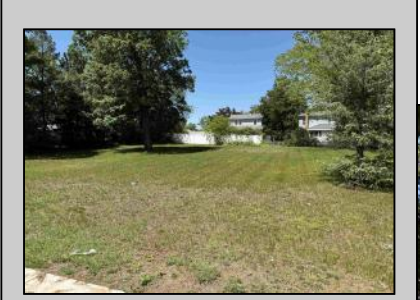
Third Mays Landing, NJ 08330