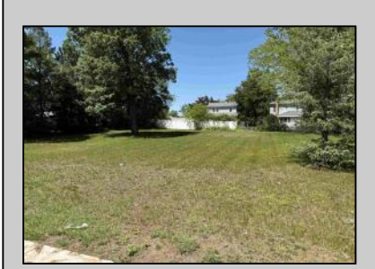
Third Mays Landing, NJ 08330