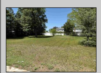
Third Mays Landing, NJ 08330