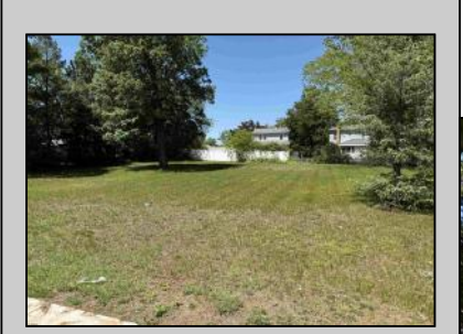
Third Mays Landing, NJ 08330