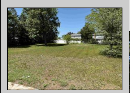
Third Mays Landing, NJ 08330