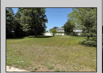
Third Mays Landing, NJ 08330