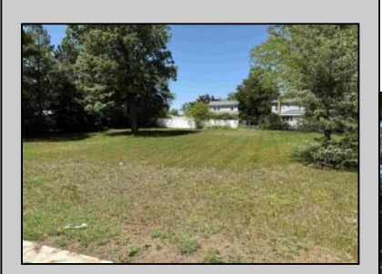
Third Mays Landing, NJ 08330