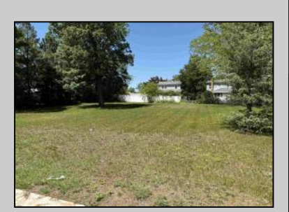
Third Mays Landing, NJ 08330