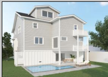
1 Hanover Margate, NJ 08402