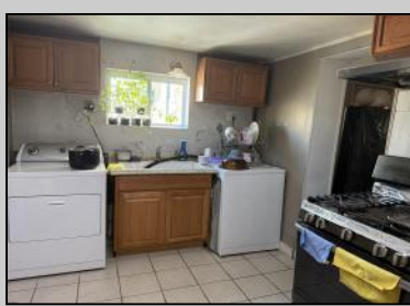
450 Harrisburg Chelsea Heights, NJ 08401