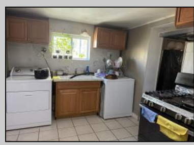
450 Harrisburg Chelsea Heights, NJ 08401