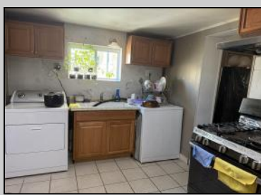
450 Harrisburg Chelsea Heights, NJ 08401