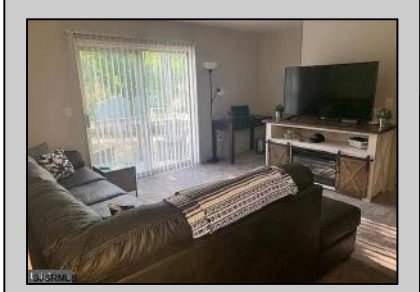
126 Club Pl Galloway Township, NJ 08205