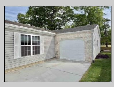
198 Pebble Beach Mays Landing, NJ 08330