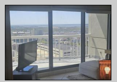
3101 Boardwalk Atlantic City, NJ 08401