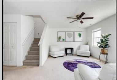
1553 John Adams Mays Landing, NJ 08330