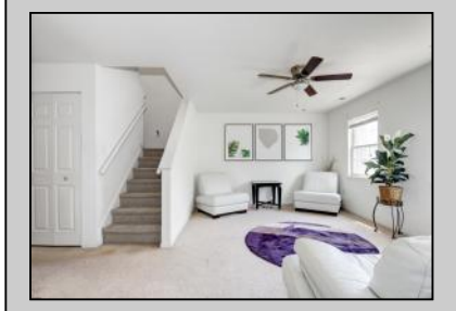
1553 John Adams Mays Landing, NJ 08330