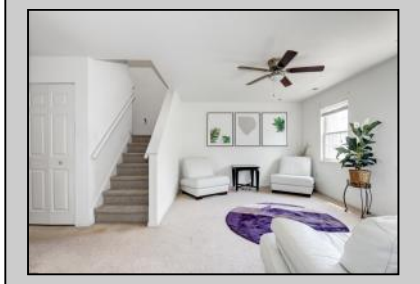
1553 John Adams Mays Landing, NJ 08330